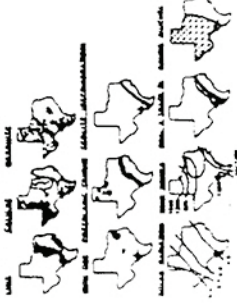
REGIONAL RESOURCES - TEXAS AS DATABASE