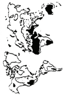
WORLD WIDE AREAS SUBJECT TO DESERTIFICATION