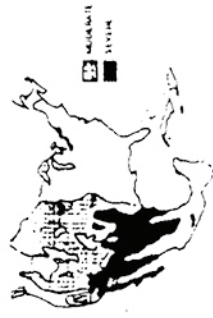
DESERTIFICATION IN THE MEXICAN PROVINCE